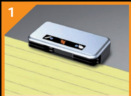
1 Attach e-pens base unit to a standard note pad.

Write, draw and edit photos on your screen with the digital pen and ordinary paper!