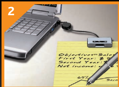
2 Connect the e-pens base unit to your PC via the USB port.