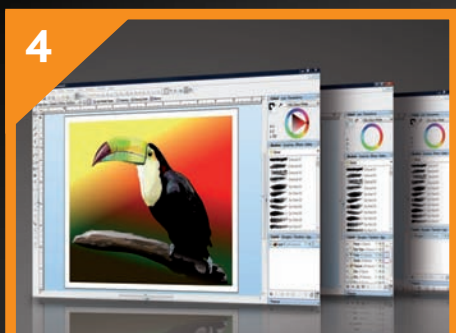
4 Edit handwritten notes and illustrations using the bundled Serif Draw Plus software.