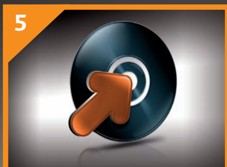
5 Save and backup captured text and illustrations.